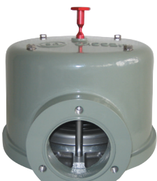
MPreC® LMPRD OD with terminal box and cover for defined oil drainage